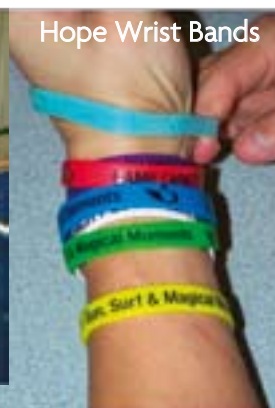
Hope Wrist Bands