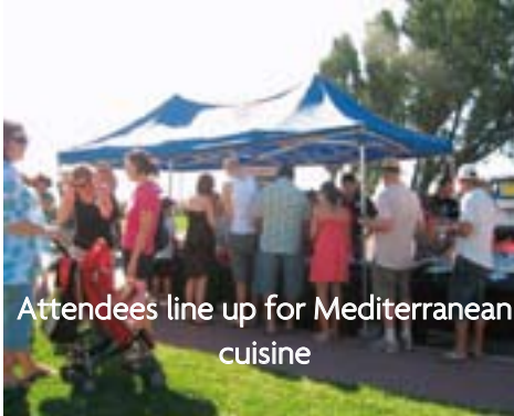
Attendees line up for Mediterranean cuisine