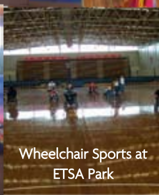
Wheelchair Sports at ETSA Park