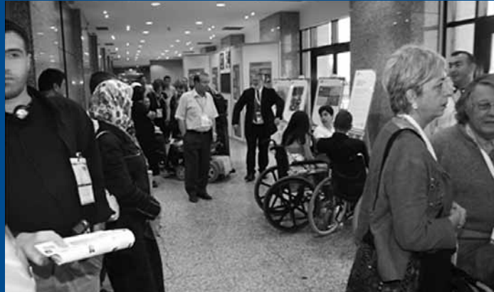
Poster Display at the WANDA conference in Istanbul