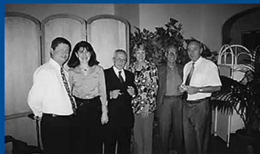
An early meeting of WANDA representatives in Naples