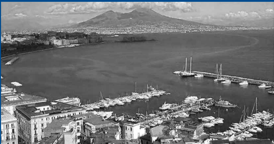
The Skyline of Naples looking across the Bay of Naples to Mount Vesuvius in the distance.

Naples is a modern city of around 4 million people with an ancient (founded 2,800 years ago) and historical, World Heritage Listed, heart set on a magnificent bay with Mount Vesuvius as a backdrop. It is rich in art, culture and gastronomy, the last, especially, for having invented the pizza. We can assure that you will receive the most cordial welcome to our city and are certain that your visit will be a most enjoyable one.