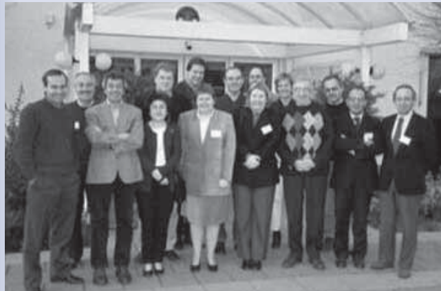
Participants at the Myotubular Myopathy Workshop

The European Neuromuscular Centre (ENMC) was first established in 1989 in Paris, France.